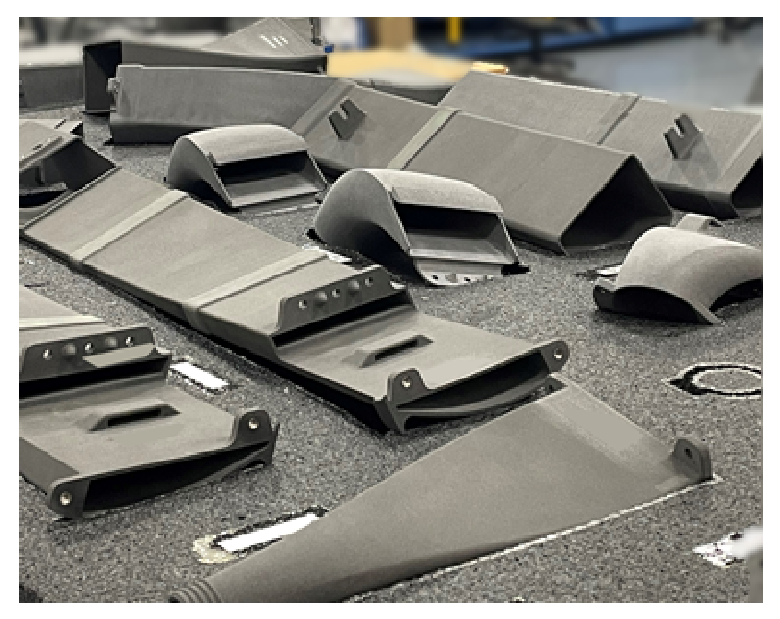
From the production floor in Poway, here is a close-up of a selection of 3D printed parts awaiting assembly into an aircraft.

have been both recruited and developed internally on the strength of what GA plant to be a long-term commitment to AM.