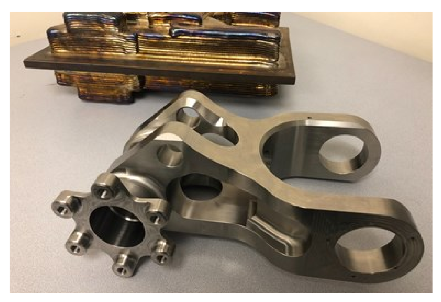
DED minimizes the amount of metal that must be lost to machining. This landing gear component was 3D printed near to net shape by Norsk Titanium, allowing for significantly less material use (and material waste) than if this part had been machined from a block-shaped billet.