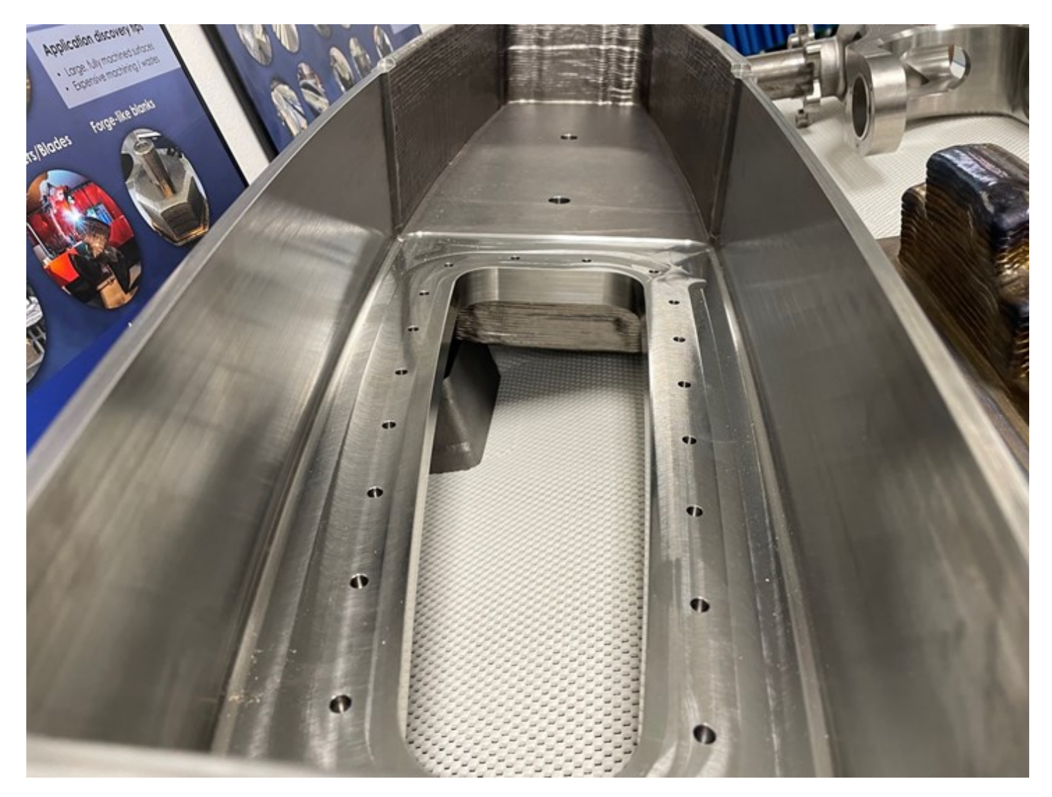
This wing splice was produced through DED by Norsk Titanium. In my report from my visit to Norsk, see a photo of the as-printed version of this part prior to any machining.

At the same time, AM has also advanced in criticality. The first metal 3D printed production part, the engine air inlet, is a class C component. The aircraft and its mission are not seriously compromised if this part fails. More recently introduced AM parts have been class B. A 3D printed nosecone is an example — this is a more critical part, but the plane can land without it. And AM is about to make its advance to class A parts. Two examples are a wing splice made via DED, and a laser powder bed fusion heat exchanger for engine cooling. These parts have the highest criticality because the plane will stop flying if they fail, but additive has demonstrated its fitness for producing these parts as well.