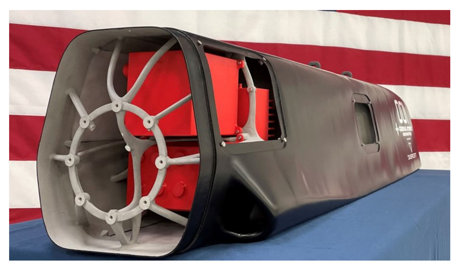
The sUAS body is made by Divergent on its Adaptive Production System. Each of the four nodes can be printed in under 13 hours. The reliance on AM allows a unitized design that in turn allows a complete aircraft to be produced in a day.

structures. Within this company's Divergent Adaptive Production System, each 2-fr and node is 3D printed in less than 13 hours. Fournier says the result has been a 60% savings in development time for the plane, because the fast 3D printing made it possible to iterate quickly, along with a 98% savings in tooling cost owing to all of the assembly that does not have to be done. An entire sUAS can be manufactured in just one day.