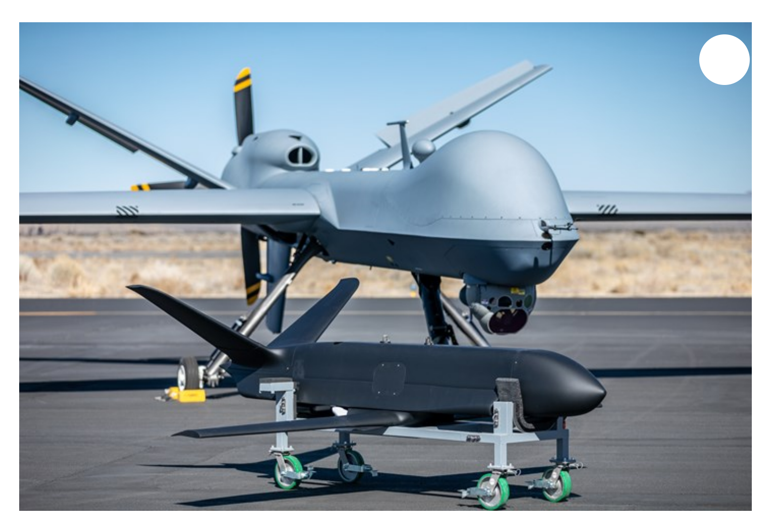
The SkyGuardian is an unmanned aerial system the size of a piloted aircraft. The forthcoming small UAS can be carried by the larger craft, extending its capabilities and mission.