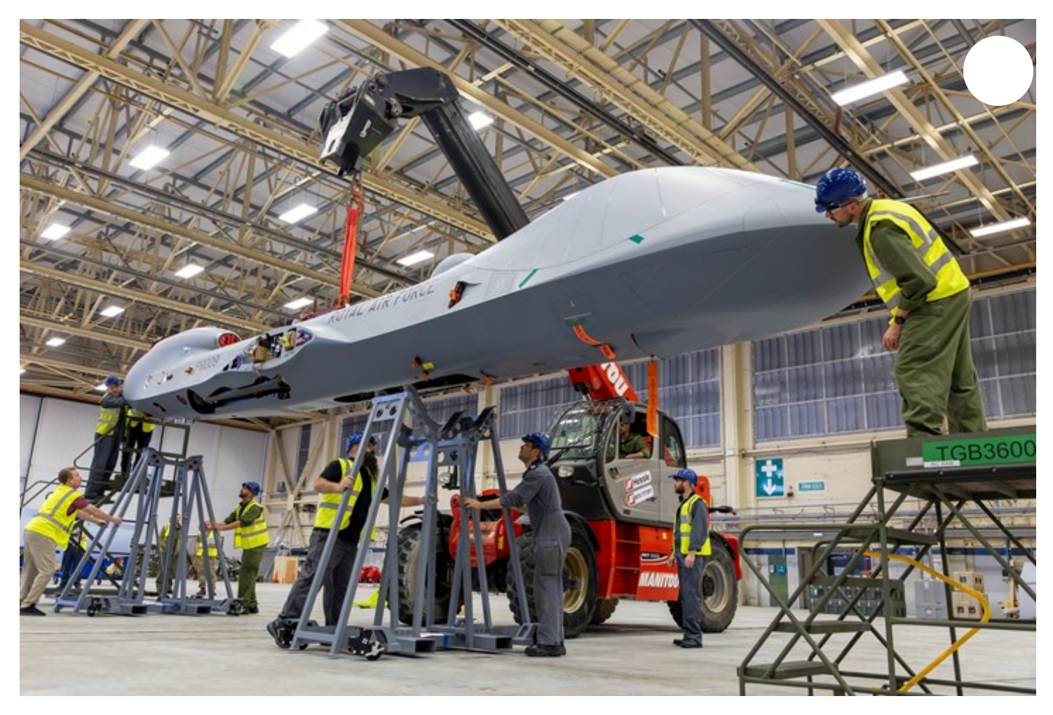
Here is a SkyGuardian being delivered to its customer destination, where the last steps of assembly occur. The recipient here is the UK Royal Air Force, which refers to the aircraft as the Protector.

Those are the advantages. Here is how GA has used them: The company had been applying AM for years, but it recognized about six years ago that additive would be a vital capability for the future of its production — to the extent that GA would have to master the capability and take control of its use of it. The company committed to building its Additive Design and Manufacturing Center of Excellence in Poway, which opened in 2021. That facility today makes production parts, as well as tooling and shop aids in use throughout the company, on resources that include multiple machines apiece for laser powder bed fusion (GE Additive), selective laser sintering (3D Systems and EOS) and fused deposition modeling (Stratasys).